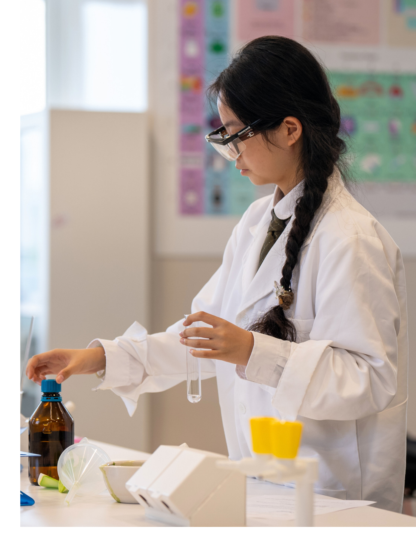
Scholarship Application Pack